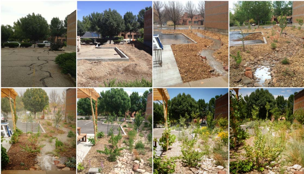
Figure 2: USU Moab Garden Progression over two years.