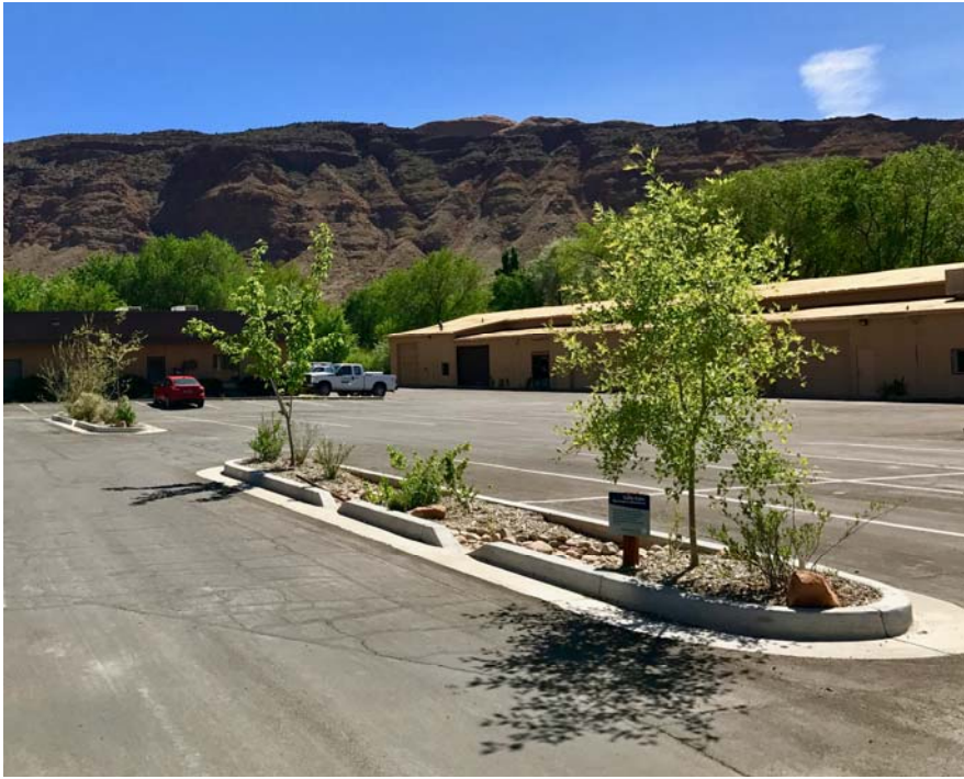
Figure 1: Parking lot shade islands with curb cuts and basins, USU Moab.